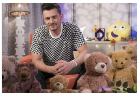
Orlando Bloom reads for 'Bedtime Stories'

The process of making the programme is a simple one. Books are sometimes chosen by the celebrities themselves, and sometimes by Claire, and the stories often reflect topical themes. The celebrities read four or five stories on a typical day's shoot and they can be surprisingly nervous. Integrity to the original book is key, and no deviation from the text is allowed. We applaud Claire's achievements in using 'Bedtime Stories' to make the enjoyment of books part of the daily routine of millions of children and their parents.